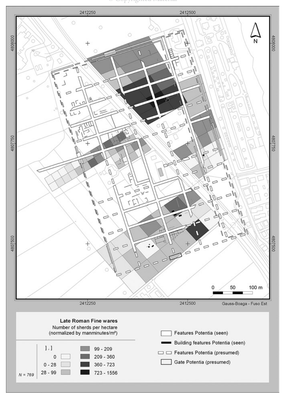
Potentia: A Lost New Town